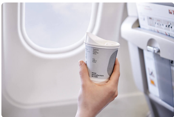
miró x SWISS

Sometimes the whole can be greater than the sum of its parts. 'In the hospitality industry, we speak a lot about suppliers,' says Sawerschel. 'Those who provide the coffee, bedlinen, laundry, housekeeping and so on. But some brands are realizing that you can leverage certain suppliers to essentially make them partners, using their name, reputation and profile to create a brand or concept with more value.' For some, it's a link to location ( Swiss Airlines offers coffee onboard from small-scale local brand Miró ) and for others, it connects to sustainability efforts ( Native at Browns is a closed-loop restaurant at Browns Brook Street). 'Maybe you're a brand working with vegan leather,' says Ingram, 'and could partner with a vegan hospitality brand, something that really aligns with – and amplifies – your brand message.' But first, says Sawerschel, you need a story, a starting point. If you don't know what you stand for, you're just going to look for any old supplier – or the next big hype.