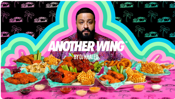
Another Wing/ Reef

There's been an acceleration of F&B brands going digital or phygital following Covid-19. Trying to exist in a hybrid world, more and more restaurants are offering delivery, creating a spatial-design problem. 'Food delivery drivers come in wearing their brightly coloured uniforms, interrupting the flow of the on-site dining experience and shattering the illusion,' says Ingram. 'Some restaurants have opted for a quick fix by having a window next to the kitchen, but new designs can better consider how pick-up is integrated into the layout and experience.'