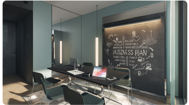
Co-Hito concept by Baranowitz & Kronenberg

While big hotel brands catch up with what independent players were doing a decade ago – designing lobby spaces to double as co-working hubs, for instance – the hybrid hotel model can be pushed further. How can new concepts counter occupancy issues, such as breakfast rooms often being empty the entire day, and meeting spaces unused over the weekends? ‘Bedrooms’ could be rented out during the day as meeting rooms or workspaces, as in the new Co-Hito concept from Baranowitz & Kronenberg , but this demands a change in perception. ‘Hotel rooms exude a certain level of intimacy,’ says Sawerschel, ‘so multifunctional rooms need to send a different message through their positioning.’