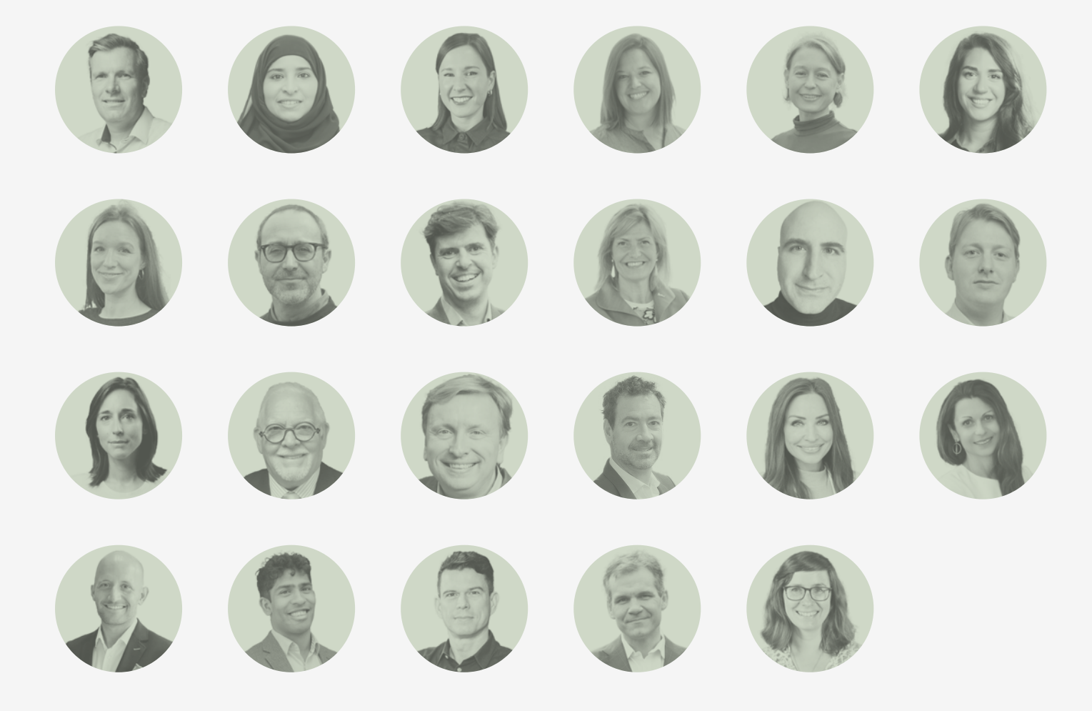
The Hotel Yearbook Foresight and innovation in the global hotel industry

Unlocking Smart & Sustainable Tech Solutions for Hospitality